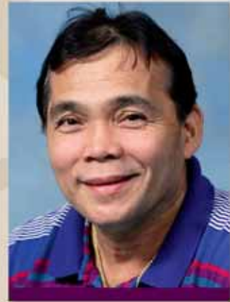
Efren Lacanlale Laundry Service