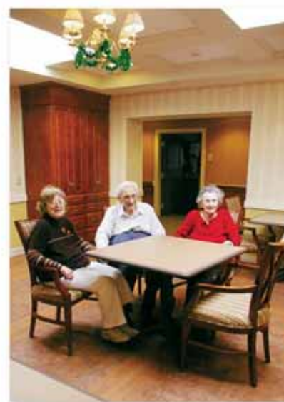
Residents fellowship in the newly completed and spacious Wissler Run facilities.

Both residents and staff are delighted with this new household.